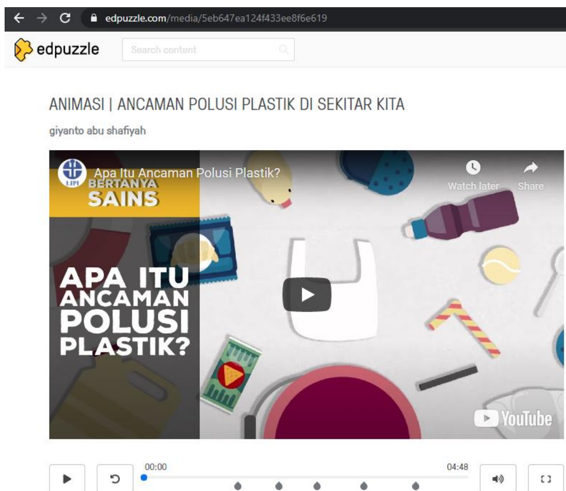
Figure 1. EdPuzzle homepage.

EdPuzzle content that has been created contains learning videos and questions that have been inserted in it to ensure that students have watched and understood the contents of the video. The front page of EdPuzzle is shown in figure 1. The EdPuzzle link can be accessed at https://EdPuzzle.com/media/5eb647ea124f433ee8f6e619 .