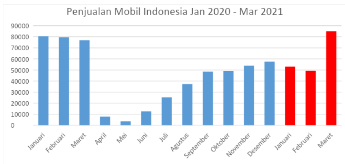
Figure 4. January 2020-March 2021 car sales period

The Ministry of Industry is optimistic that the PPnBM relaxation expansion policy can run well and be more targeted, so that it benefits the community as consumers, industry, and also the government. Based on the explanation above, according to the author, the regulation on relaxation of PPnBM based on the Regulation of the Minister of Finance No. 20/PMK.010/21 concerning Sales Tax on Luxury Goods on the Delivery of Taxable Goods Classified as Luxury in the Form of Certain Motorized Vehicles Borne by the Government for the 2021 Fiscal Year is the right step taken by the government. Although in terms of tax revenue, with the relaxation of PPnBM, the state will lose its tax revenue, but it will be compensated by the increase in demand and production of motorized vehicles. With the growing demand and increased production compared to the previous year, the calculation will be more positive than the potential loss. The government itself has calculated that the decline in tax revenue from the automotive sector will be followed by better economic growth, so this policy is considered quite positive for the state treasury.