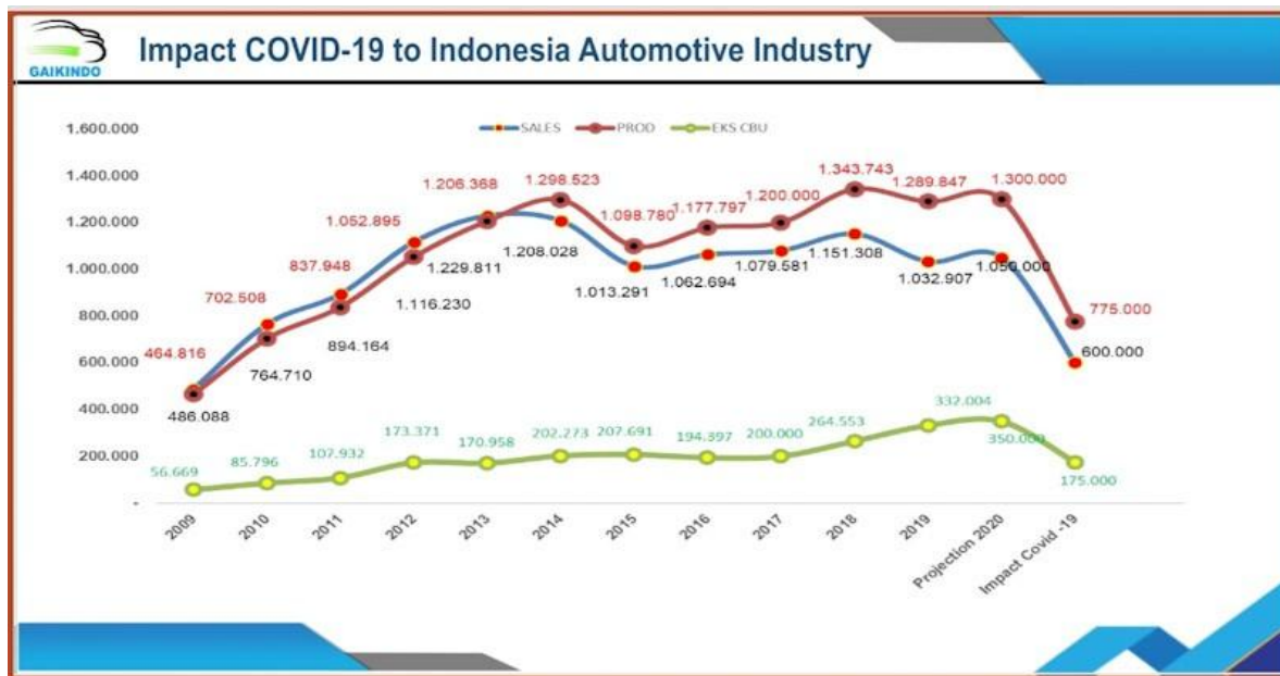
Figure 3. Impact Covid 19 to Indonesia Automotive Industry

But on the other hand, the implementation of PPnBM relaxation is also considered difficult to increase car sales at this time. It is difficult to increase car sales through this policy because population mobility is still relatively low and people's priorities are not buying a new car, but rather spending on health, food and drink, and other primary needs. In addition, the relaxation of PPnBM will not necessarily encourage an increase in motor vehicle loans. Banking and leasing are facing the risk of bad credit, so they are more selective in choosing prospective debtors. Meanwhile, according to him, cars with specifications below 1,500 cc are a niche market for vehicles with a price range that is dominated by consumer groups that have been negatively affected by the pandemic, so that the provision of PPnBM incentives for this car is considered not to have a significant impact on boosting new car sales. Not only that, tax observers from the Tax Research Institute (TRI), also explained that there would be other negative impacts, such as declining car sales in adjacent segments that do not receive PPnBM relief, such as the used car sales market. The sales decline is projected to reach 30 (thirty) percent.