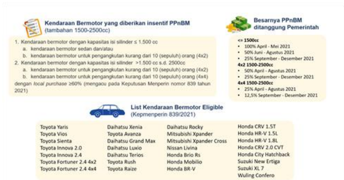
Figure 1. Principal Policy on PPnBM Motor Vehicle Incentives (PMK 31/PMK.010/21 & Decree of the Minister of Industry Number 839 of 2021)

As quoted in the Fiscal Report that the number of sales after the implementation of the tax incentive policy / PPnBM DTP for motorized vehicles, car unit sales in March 2021 experienced a very significant increase, especially in 4x2 vehicle types which reached an increase of 25,000 units compared to the previous month.