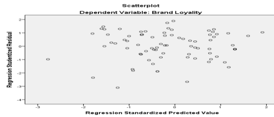
Fig 2. Heteroscedastity Test Scatterplot Graph

Fig 2 above shows that the data distribution is around zero points. The results of this test indicate that the regression model is free from heteroscedasticity problems.