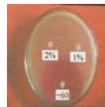
Figure 2. Minimum Inhibitory Concentration is 2% of ethanolic extracts