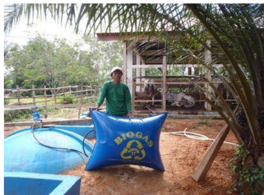
Figure 3. Biogas container bags

Supporting components of bio-digester are added to produce biogas in large quantities and safe to be used such as installation of biogas pipes, biogas pumps, biogas container bags (Figure 3), manometers, and valves or gas taps (Wahyuni 2017).