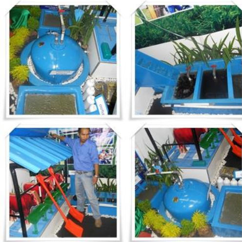
Figure 2. Biogas components

The main components of biogas include digester equipped with an inlet and outlet, gas shelter, and sludge shelter (waste in solid and liquid form) (Wahyuni 2017).