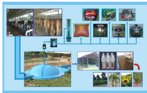
Figure 4. Biogas application