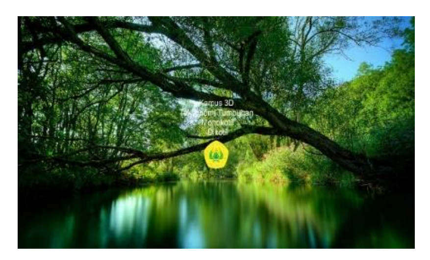
Figure 2. Splash Screen

The implementation of the 3D application was done through data collection, object segmentation, create object texture and create 3D object. The application will start from the splash screen followed by the main menu to select one of the desired plants. Once elected, you will find images by selecting part of good overall, stems, leaves, flowers, or fruit. Even there you will find a description of the plant. As for the plant's own image, because the three-dimensional shape, you can change the size of either enlarged or reduced, or changes the direction of the play, right, left, up, or down. The results that have been made were shown in Figure 2 and Figure 3.