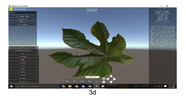
Figure 3. Application display: 3a. Main menu, 3b. Searching and sorting, 3c. Leaves design, 3d. Leaves design and zoom